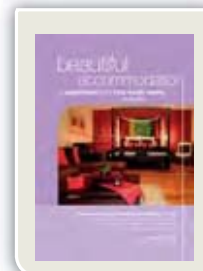
queensland and new south wales