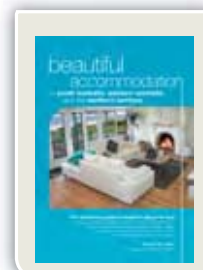
south australia, western australia and the northern territory

The Beautiful Accommodation guidebooks feature an exclusive collection of over 600 handpicked, visited, reviewed and photographed properties from all over Australia. Available for purchase at bookshops, selected newsagents, RACV, NRMA, RACQ and other RA outlets stores or via the website: http://www.beautifulaccommodation.com .